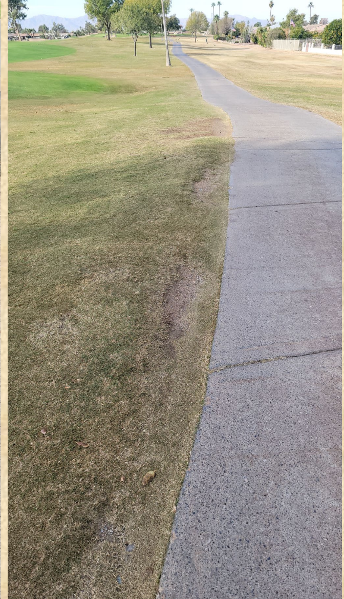
Excessive Wear Around Tee Box