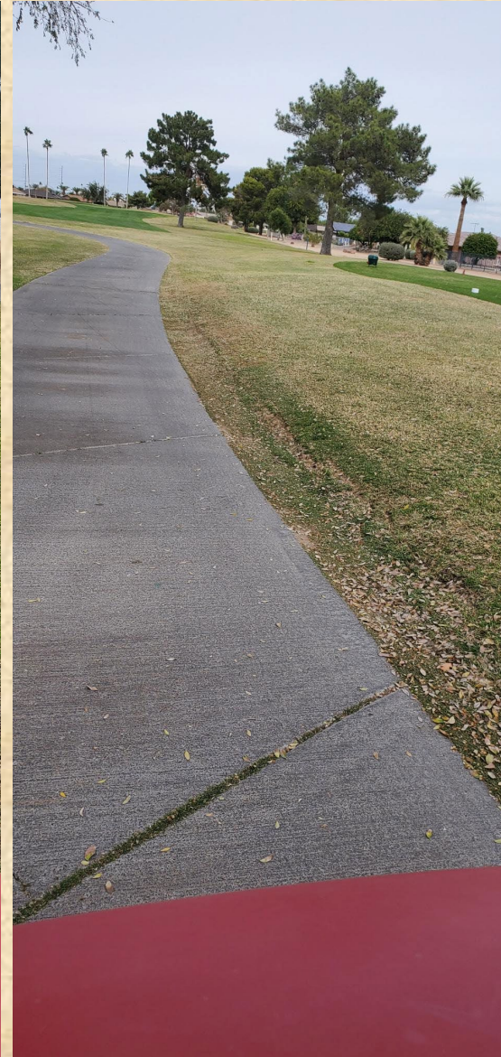
Excessive Wear Around Green and Tee Box